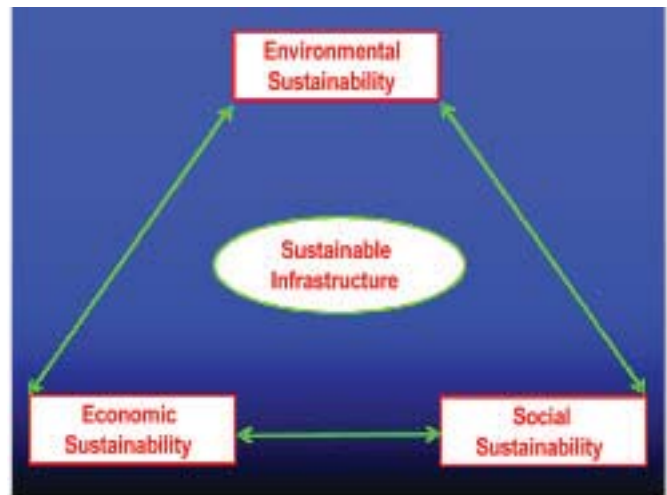
Figure 1. Sustainable Infrastructure Triangle (Adapted from UNEP, 2008)

In addition to the 3-S Design Concept, the sustainability triangle for drinking water and wastewater infrastructure was adapted from the sustainability literature (UNEP, 2008) and is shown in Figure 1.